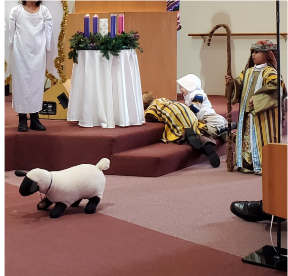
Yep, those sheep sure wander!