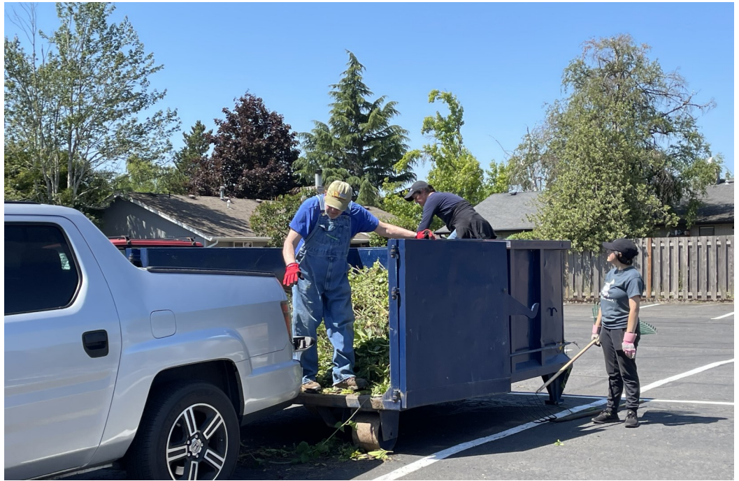
Ta da—after all of the hard work

A whole dumpster full of yard debris. Thank you to the Query's for arranging the large blue cart.